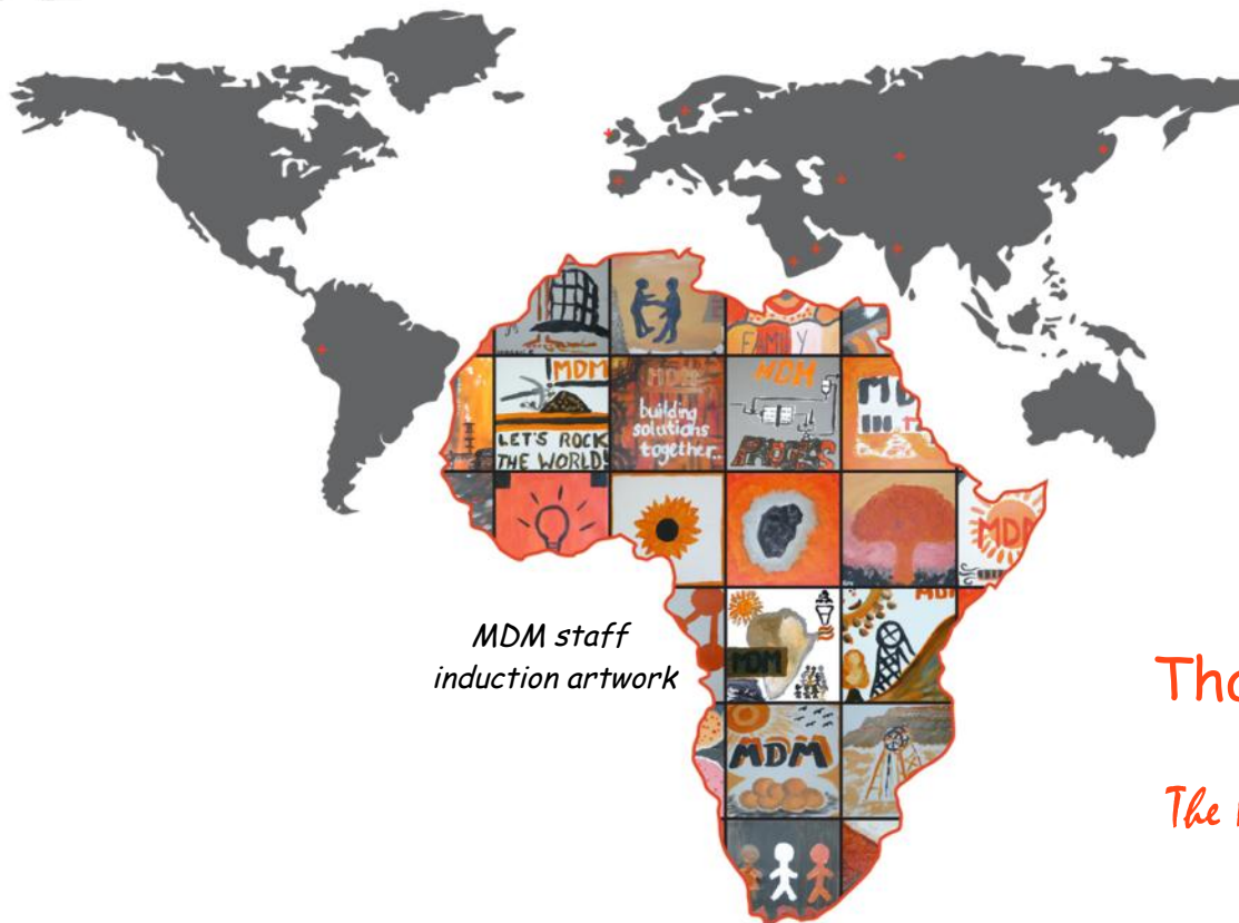
MDM staff induction artwork